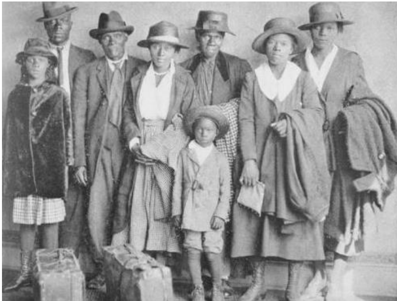
An African-American family migrating north.

During World War I, Robert managed to anger the Woodrow Wilson administration on several occasions with his editorials on the poor treatment of African-Americans by the armed forces. Then, on 15 May 1917, less than five weeks after the United States officially entered the war, Robert launched a very different campaign: he began encouraging Southern blacks to move to northern cities where there would be abundant opportunity to improve their lives. Roi Ottley commented: “The man’s crusade to bring Southern Negroes north was perhaps the most gigantic project he attempted and his most notable achievement. Nearly a million migrated on his urgings.” 16