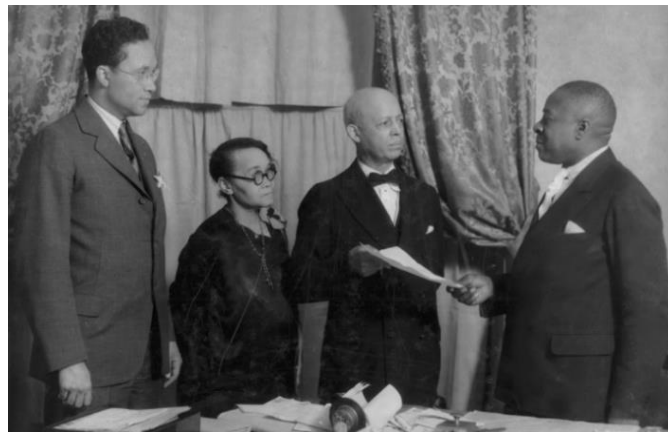
Robert with some of his key lieutenants in the mid-1920s.

A massive and rapid transition, however, was on the immediate horizon. By the start of World War I the paper's circulation had expanded into several states and the number of weekly copies had risen dramatically to over 100,000. Roi Ottley estimates that on average each copy was passed on to five different people meaning a half-million weekly readers. Thanks to Robert's many and diverse talents and his steeled determination, the paper had become the largest African-American publication in the country.