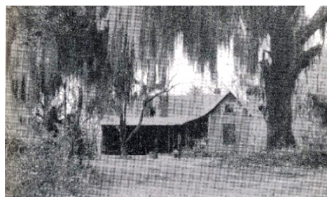
1868 birthplace of Robert Sengstacke Abbott, St. Simons Island, Georgia.