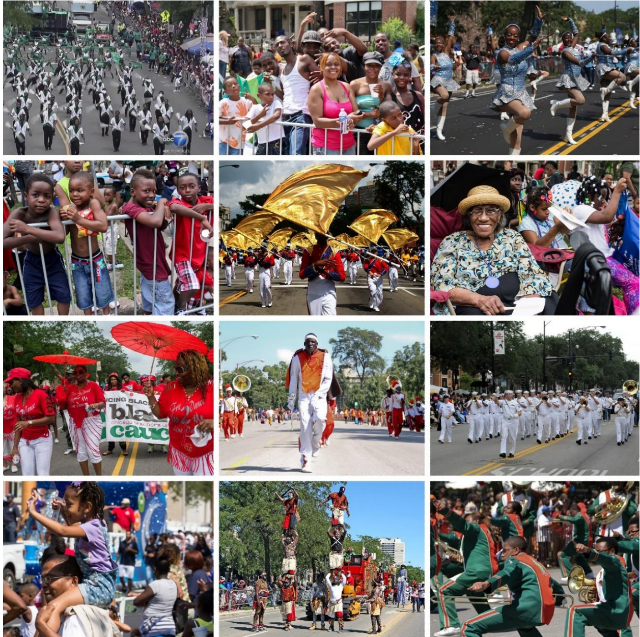
Scenes from recent Bud Billiken parades.

1929 also saw Robert launch his first attempt to publish a black magazine, Abbott's Monthly . Despite the stock market crashing four weeks before the first issue appeared, the monthly initially succeeded. However, with the nation economically devastated and experiencing massive unemployment, the magazine was inevitably doomed and survived for only four years.