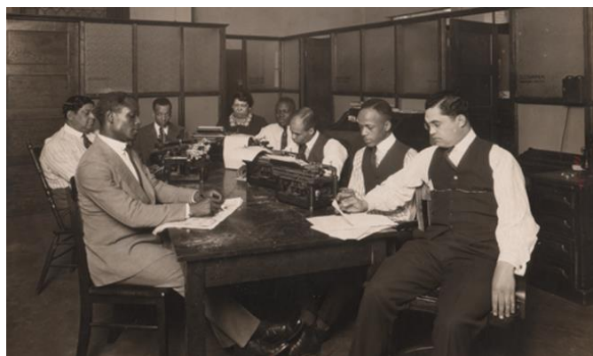
Defender reporters during the 1930s.