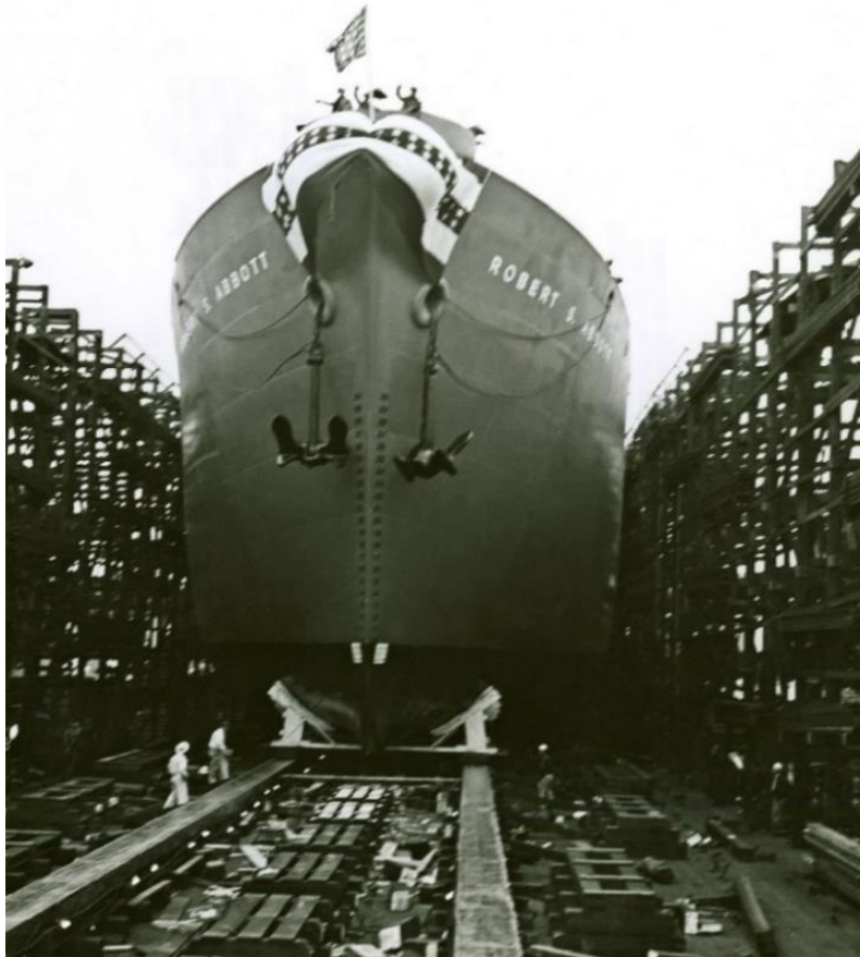
1944 launching of the S.S. Robert S. Abbott .

Launched into the San Francisco Bay at Richmond, California, on 13 April 1944, the S.S. Robert S. Abbott was one of only 13 liberty ships named for outstanding African-Americans. Even the ship's history is compelling, for it was later given by the United States to Russia where it was renamed the Kamenets-Podolsk in honor of 23,600 Jews who had been slain in a Hungarian town of the same name during a two-day period by Nazi troops.