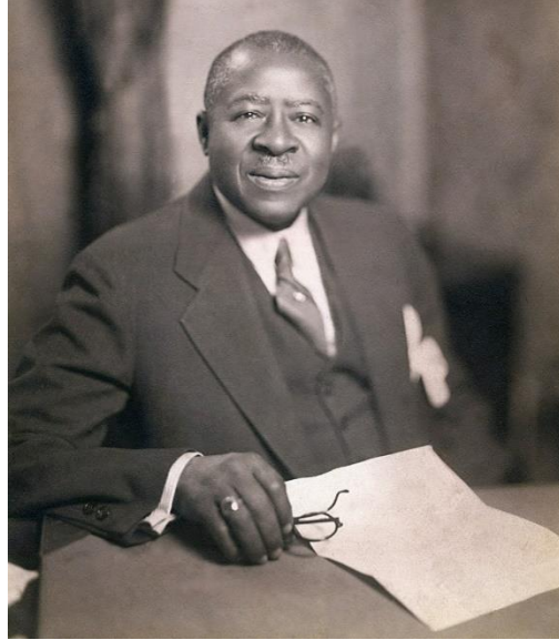
Robert Sengstacke Abbott—1868-1940

Abraham Lincoln, drawing insight from the Bible, declared in an 1858 speech on the future of the United States that “a house divided against itself cannot stand.” 1 This truism sweeps from the family hearth to any group, community, nation—right to the heart of civilization, itself. There are numerous fundamental realities of humanity that can help keep any “house,” any group, strong and resilient. These include unity, harmony, understanding, respect, compassion, and especially love of the human race. These concepts are at the heart of the Robert S. Abbott Race Unity Institute.