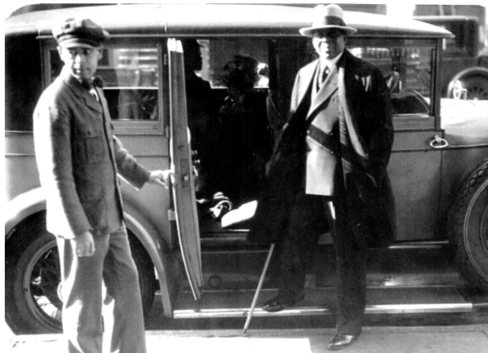
Robert and his chauffeur in front of one of the many luxury cars he owned.

Robert's frugality as a businessman not only kept operating costs low but contributed to his growing wealth. In the mid-1920s he became one of this country's first millionaires of African-American descent, drawing a weekly salary of $2,000, the equivalent today of $27,300. The focus of the paper also expanded beyond racial conflict to topics such as sports, the arts, fashion, stories of blacks from other parts of the world, and numerous articles and editorials about crime in the Windy City. Robert also launched a column written by a local doctor which focused on such topics as hygiene, nutrition and infant care. The column also encouraged abstinence from alcohol and gambling. Robert's continuing efforts to improve the role of African-Americans in the workplace resulted in measurable progress in Chicago, particularly in the city's fire and police departments.