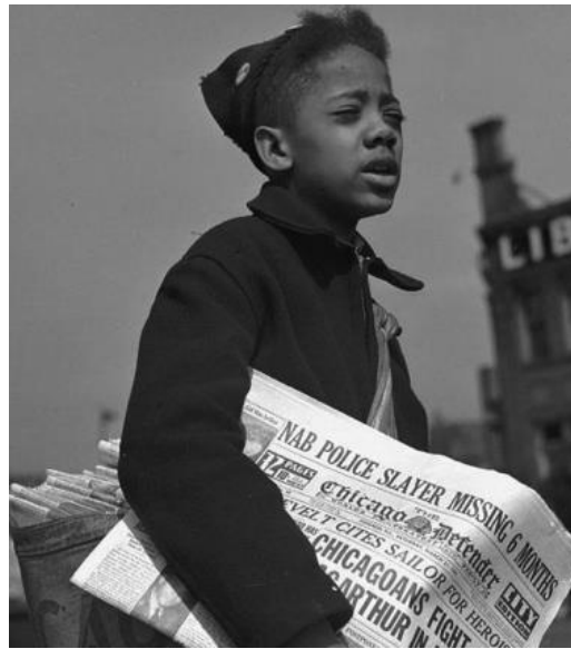
A young newsboy selling the Defender in Chicago in the 1940s.

penury was legendary. Yet he gave away thousands and was swindled out of thousands more. 20