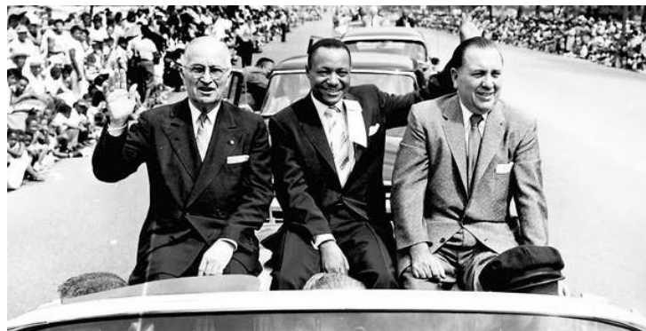
Former President Harry S. Truman, left, Robert's nephew, John Sengstacke, and Chicago's Mayor Richard J. Daley at the head of the 1956 parade.

The parade continues today as a major yearly event in Chicago. In addition to celebrities, it has hosted numerous politicians, beauty queens, athletes and others famed for various reasons. Among them are Bo Jangles, Lionel Hampton, Jackie Robinson, James Cagney, Frank Sinatra, Hopalong Cassidy, Michael Jordan, Joe Louis, Spike Lee, Duke Ellington, Muhammad Ali, Adelaide Hall, Lena Horne, Oprah Winfrey, Ethel Waters, Cab Calloway, Diana Ross, Paul Robeson, Billie Holiday, and President Harry S. Truman. Robert's nine-decade-old symbol of pride, happiness and hope attracts more than a million people each year while 25 million more watch it on television. Only one parade in the United States is larger: the Pasadena, California, New Year's Tournament of Roses.